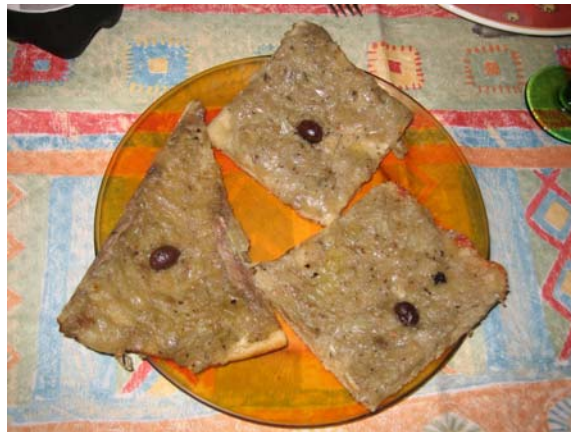
Trois morceaux de pissaladière

Next recipe (la prochaine recette) « surprise » !