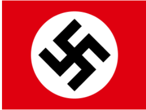
Nazi Germany Flag

The United States officially went to war on December 8, 1941. President Roosevelt, as Commander-in-Chief of the military, obtained an official declaration of war from Congress.