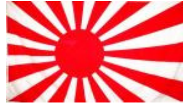
Imperial Japan Flag

This was one day after Japan bombed Pearl Harbor, an American naval base in Hawaii. Japan's partners in the Axis, Italy and Germany, then declared war on the United States, Great Britain, and their Allies. The Allies fought against the German Nazis, the Italian Fascists, and Japan's military empire. This was very difficult for the United States, which had to fight wars in both the Pacific region and Europe.