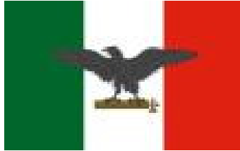
Fascist Italy Flag